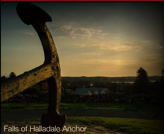
Falls of Halladale Anchor